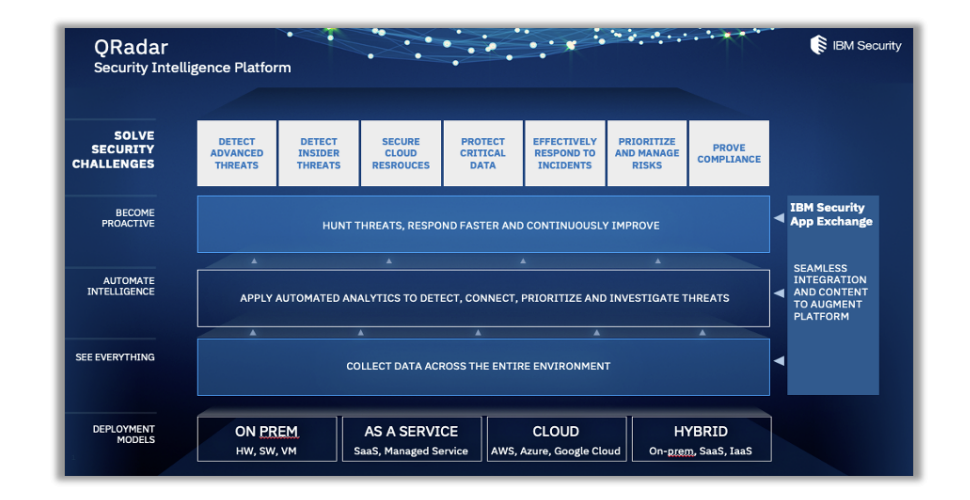
IBM QRadar Security Information and Event Management